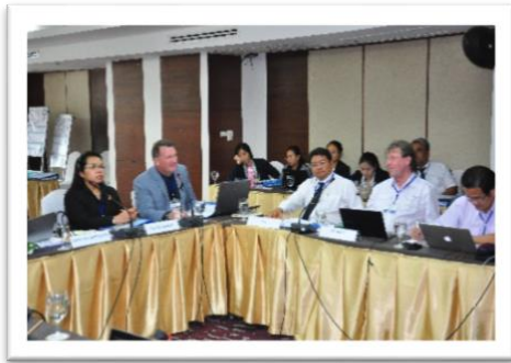
Fisheries Refugia Project Inception Meeting in Bangkok, Thailand on 1-3 November 2016