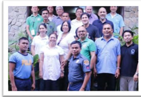
Site Level Inception Workshop and Baseline Data Collection in Coron, Palawan, Philippines on 23-25 March 2017