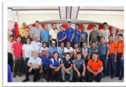
Site Level Inception Workshop and Baseline Data Collection in Masinloc, Zambales, Philippines on 23-25 March 2017