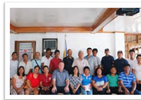
Site Level Inception Workshop and Baseline Data Collection in Bolinao, Pangasinan, Philippines on 23-25 March 2017