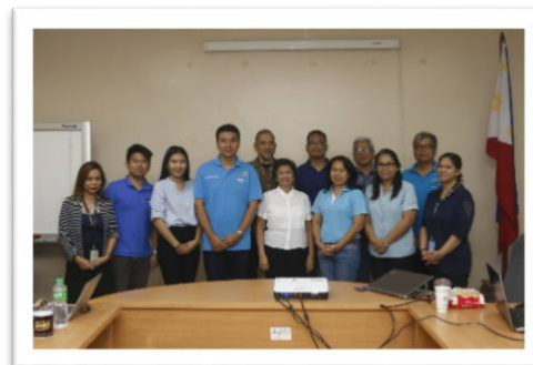
A Support Mission by Project Coordinating Unit in Cambodia, 18-20 July 2018(Left), A Support Mission by Project Coordinating Unit in Philippine, 20-22 June 2018(Right)